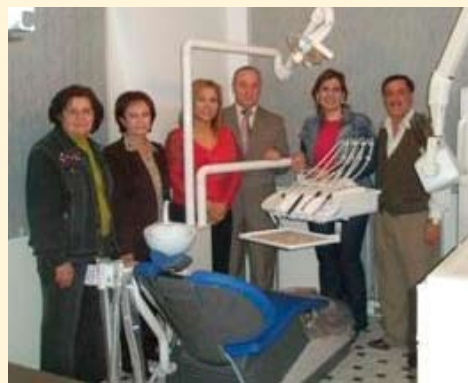
Members of the Rotary Club of Sahel Aley and Ladies League of Chowiefat deliver equipment to the free dental clinic in Chowiefat, Lebanon.

About 75 percent of the 150,000 people living in Chowiefat, Lebanon, and surrounding towns are poor or have below-average incomes. A